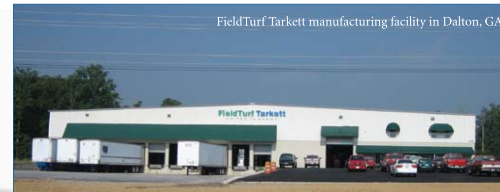
FieldTurf Tarkett manufacturing facility in Dalton, GA

Establish a project goal for locally sourced materials and identify materials and material suppliers that can achieve this goal. During construction, ensure that the specified local materials are installed. Consider a range of environmental, economic and performance attributes when selecting products and materials.